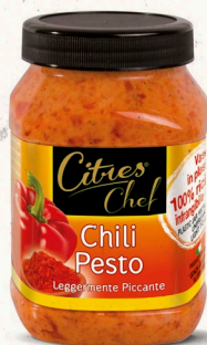
Chilli Pesto 1.000 g