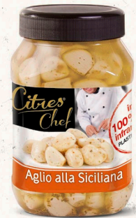
Sicilian garlic 990 g