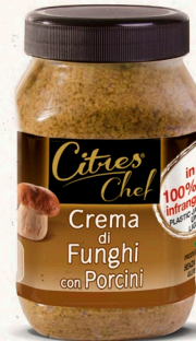
Creamed mushroom 970 g