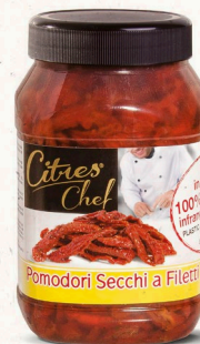
Sun-dried tomato strips 980 g