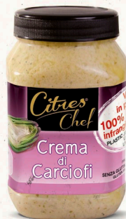
Creamed artichoke 970 g