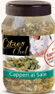
Capers in salt 900 g