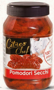
Sun-dried tomatoes 980 g