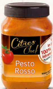
Red Pesto 1.000 g