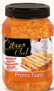
Sandwich spread 960 g